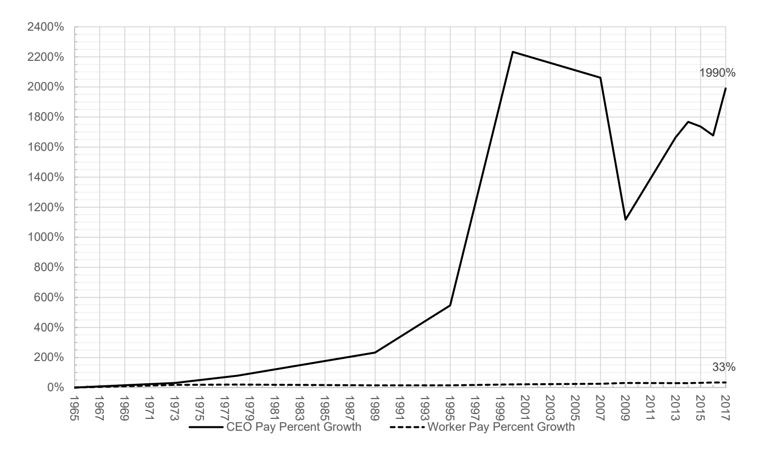
Exhibit 2, HBS Research Note. TJX.

CEO pay rose by almost 2000% from 1965 to 2017, while pay for the average worker grew by only 33% during the same period.