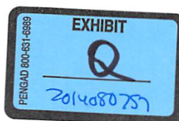
EXHIBIT Q - 001