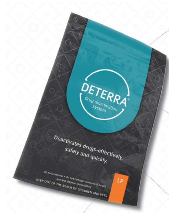
Deterra Kits for proper disposal of unused opioids