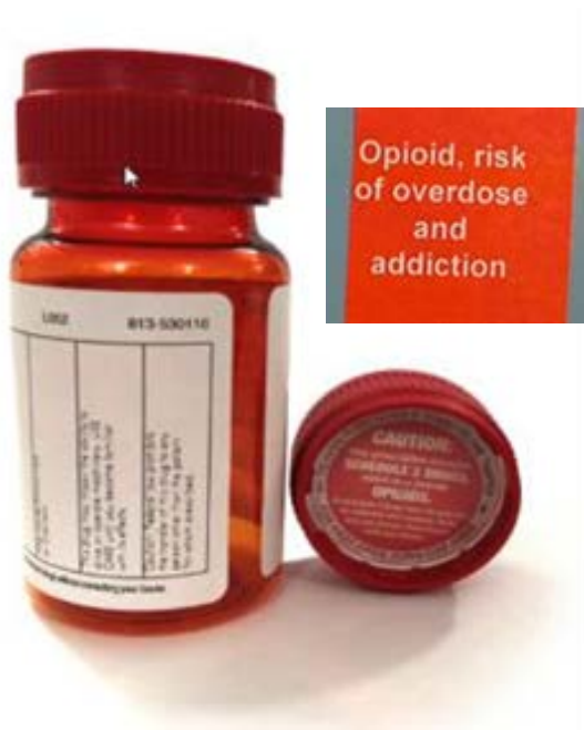
Bottle cap label warnings